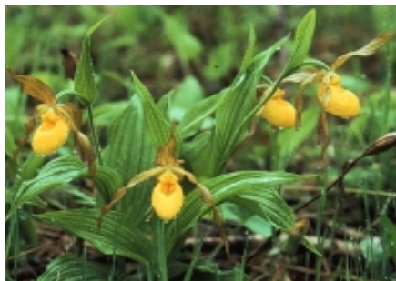
Yellow Lady's Slipper

*Designated Michigan Natural Area Michigan's Natural Areas represent landscapes that have preserved unique, unaltered features. Many areas showcase examples of geologic, natural resources.