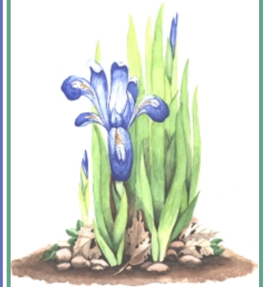
Dwarf Lake Iris